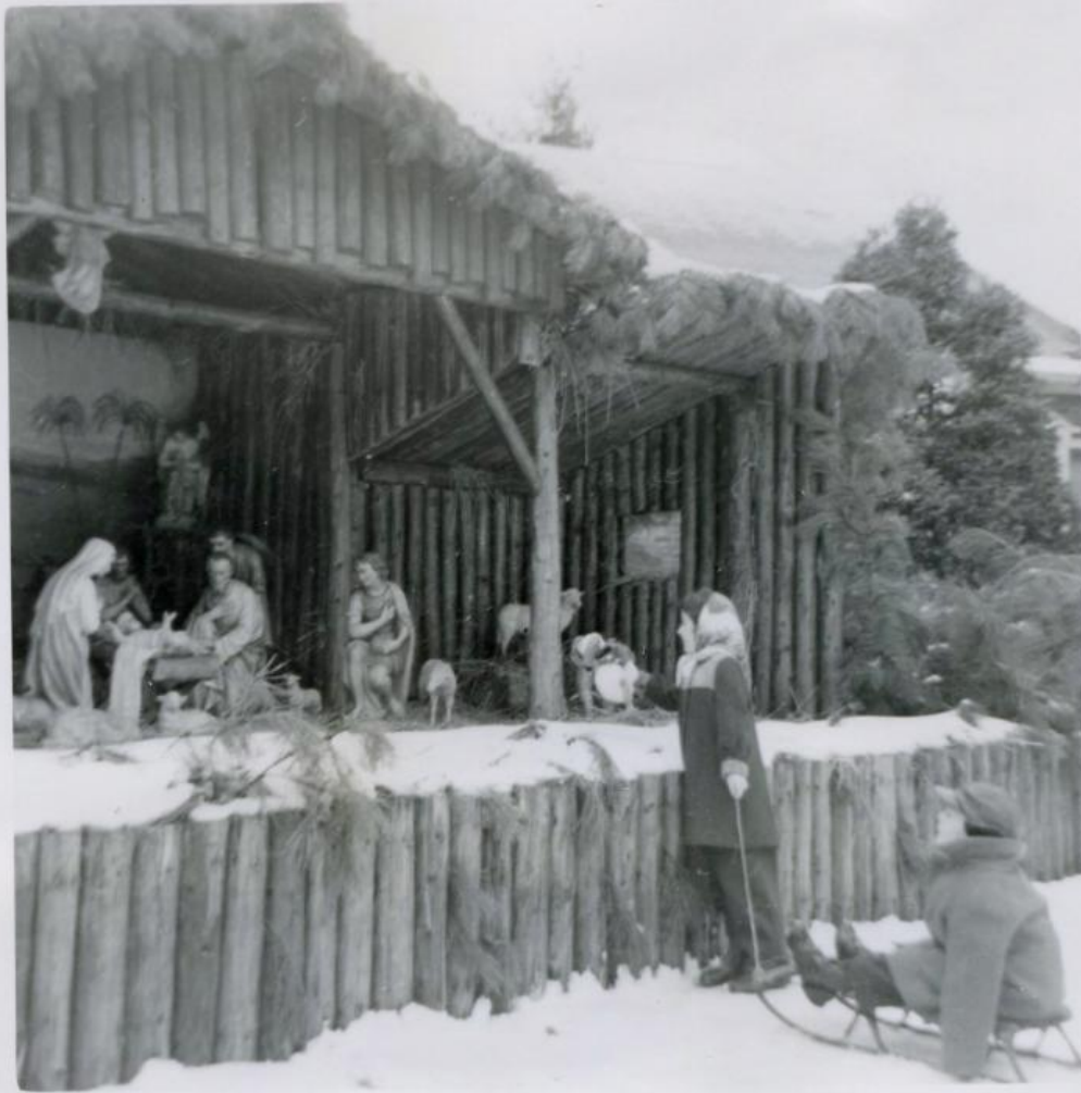
1947 Crib in front of St. Anthony Hall