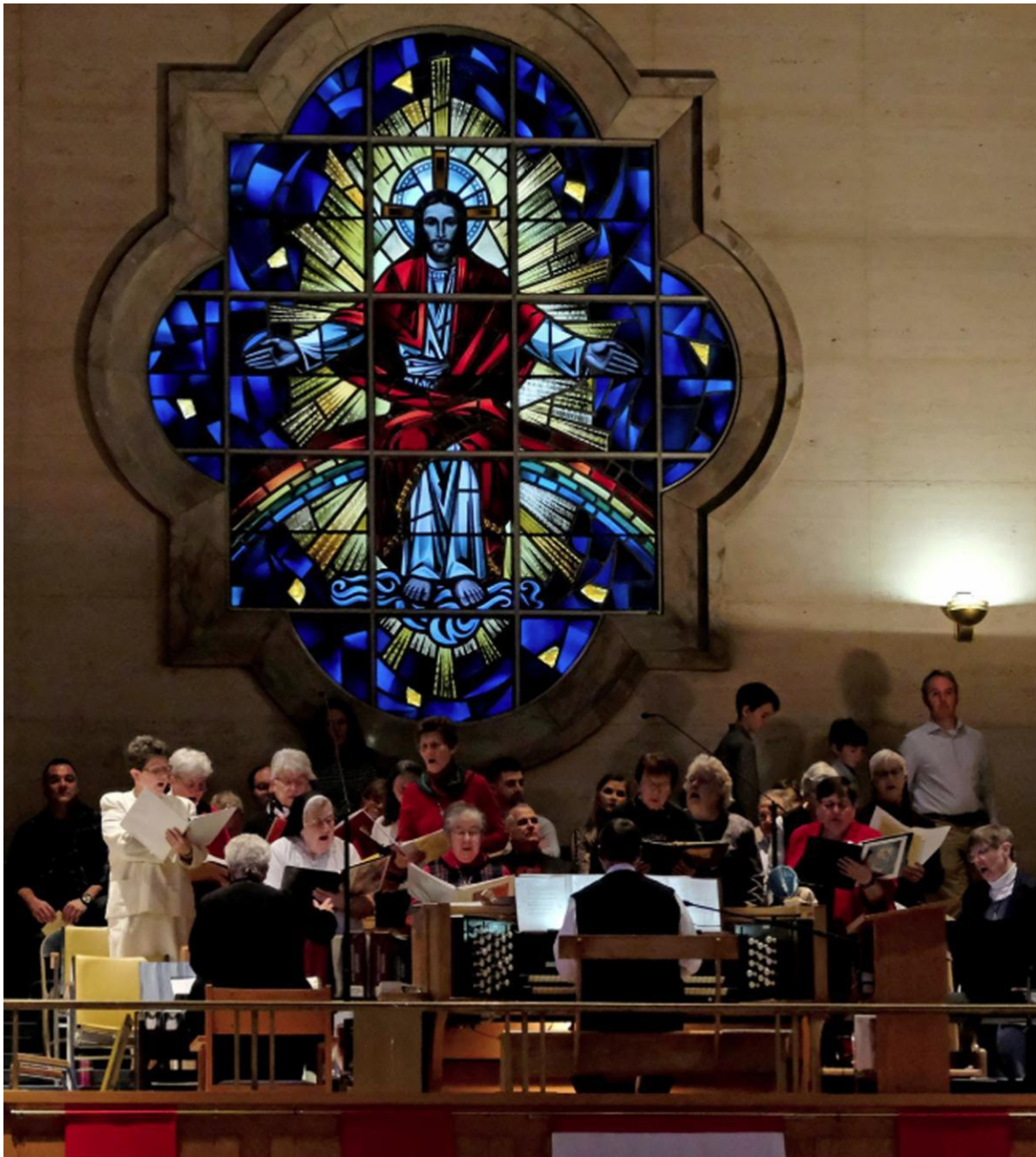
The Sylvania Franciscan Choir, singing their hearts out under the "Prince of Peace" window in the loft of Queen of Peace Chapel.